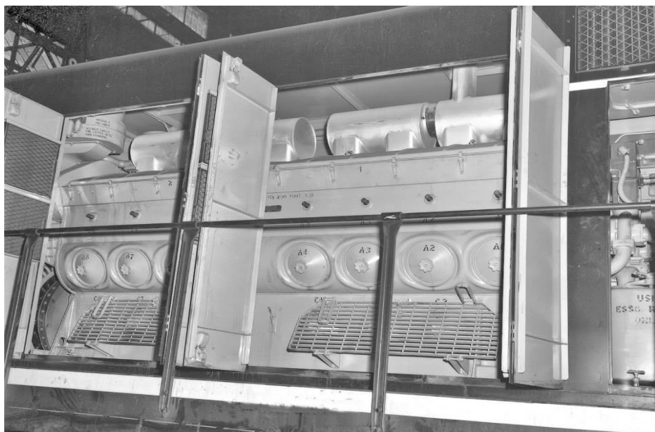
Prime mover from IC 9330 GP 9 in 1958

Meeting * Tuesday Sept 8th 7PM At the Museum Meeting Room.