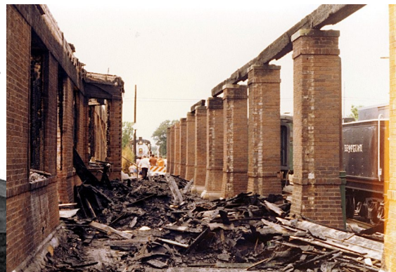
Marion Depot after the fire 1977. You can see a CO&E tender to the right in the photo and their steam engine straight ahead. CO&E last Steam Loco # 17 resides at Boone Scenic Railway in Iowa as a static display.

GRAND RAPIDS, Mich. — A Federal judge is expected to hand down a sentence today (JAN 10th, 2018) for a former Canadian National signal maintainer accused of cutting circuit wires necessary to keep crossing gates raised.