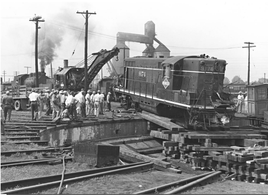
Steam rescues diesel. In June of 1958 IC 9174 ran off into the turntable pit in the Carbondale yard. The Big Hook was brought out by steam engine.