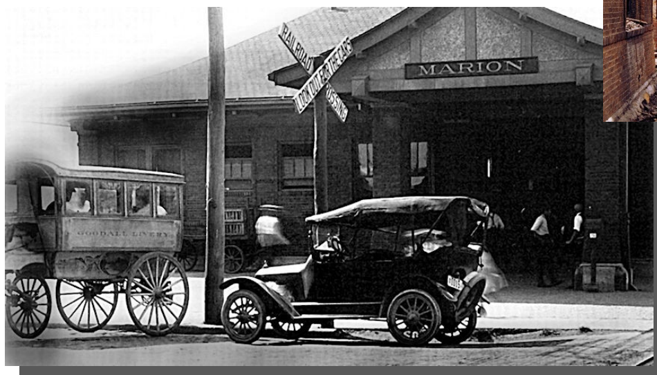
Marion IL IC depot circa 1915. It appears there are 2 types of transport here, automobile and horse and buggy. This building was destroyed by fire in 1977.

Work is now underway to swap displays and work on maintenance of other displays.