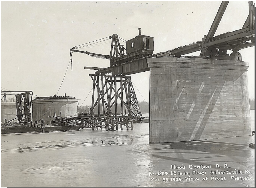
Illinois Central R. R. Br. J204-60 Tenn. River Gilbertsville, Ky. Mar. 28, 1905 - View of Pivot Pier, etc.