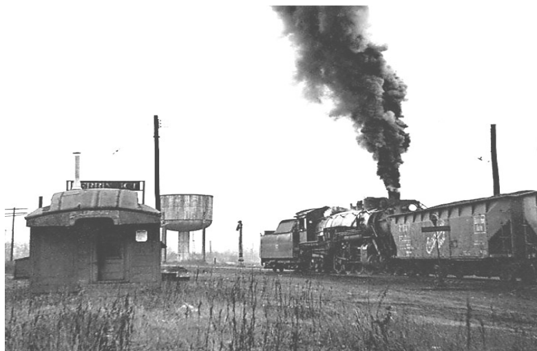
Steam at Herrin IL in this undated photo

Next Meeting Feb 12th 7 PM At the Railroad Museum Paducah